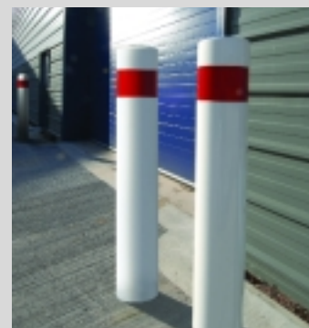
Streetwise® 150 Dome Single Ring